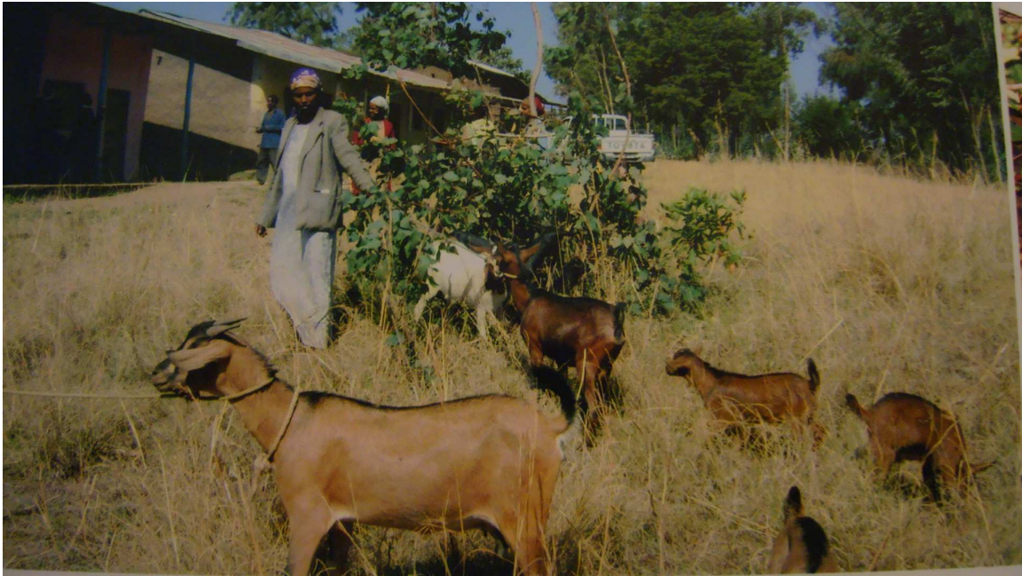
Figure 2. Men participated on small animal fattening