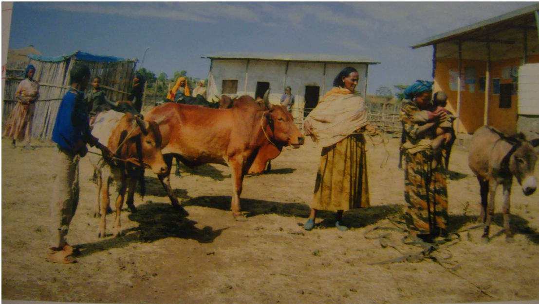
Figure 1. Women participated in dairy cow production