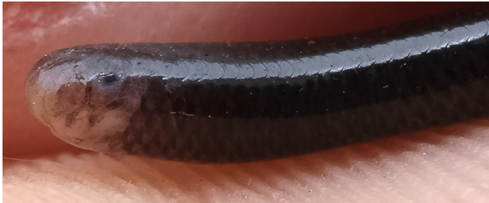
Figure 3. Lateral view of the head of an Indotyphlops braminus observed on Saba, Dutch Caribbean.

Both Indotyphlops braminus and Gymnophthalmus underwoodi are established on several other Lesser Antillean islands as well as in Florida (USA). Given that most Saban inter-island traffic of goods and people occurs with neighboring St. Martin, populations there are the most likely source of the Saban introductions. On neighboring St. Eustatius, also part of the Dutch Caribbean but with less frequent traffic connections with St. Martin, only I. braminus is present, although its presence has been inconsistently reported (Powell 2006, 2011, Henderson & Breuil 2012, Powell et al. 2015, van Wagensveld et al. 2020).