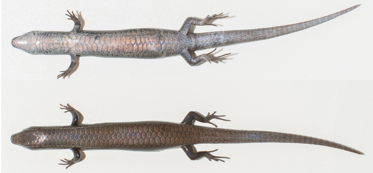
Figure 2. Gymnophthalmus underwoodi specimen (SVL = 40.64 mm) collected on Saba, Dutch Caribbean.