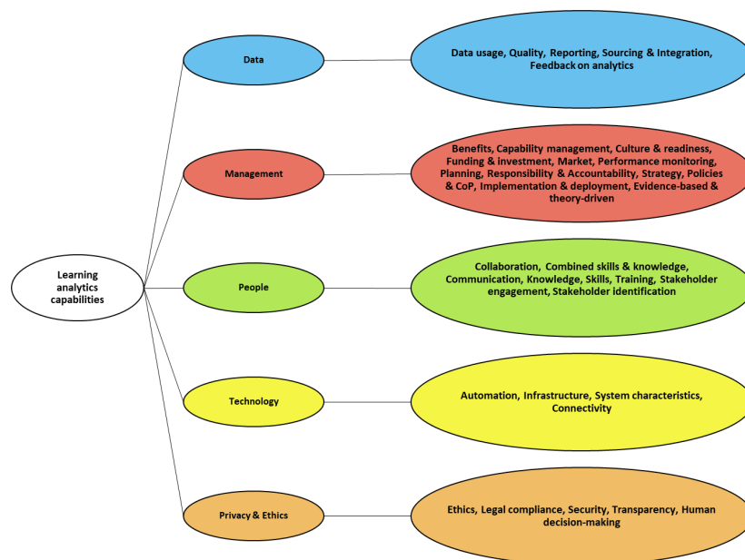
Fig. 3. Learning Analytics Capability Model

By researching big data analytics, business analytics as well as learning analytics literature, we found five categories with 34 different capabilities comprising 461 operationalizations. Combining all these capabilities leads to the first version of the Learning Analytics Capability Model: a model specifying what organizational capabilities higher educational institutions need to develop to support the successful adoption of learning analytics and in what way to operationalize them. The model facilitates an increase of learning analytics adoption by higher educational institutions and, as a consequence, helps the field of learning analytics advancing to a higher degree of maturity. We present the Learning Analytics Capability Model in Fig 3.