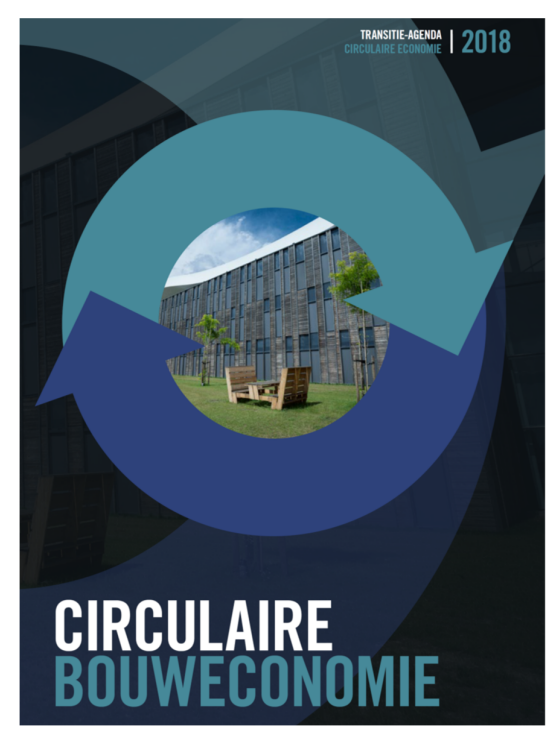
Figure 1. Cover of the national transition agenda for circular building economics.