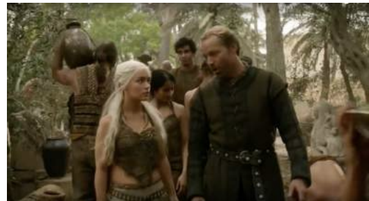
Figure 6 – Season 1, Episode 7

In season one , Viserys sells her to Khal Drogo, a wild warlord, who promises him an army in return. At her wedding, she receives three petrified dragon eggs and is introduced to Ser Jorah Mormont (see Appendix VII), a knight from Westeros, who accompanies them henceforth. Daenerys starts adapting to and enjoying her new family (figure 6), which seems to give her confidence to prevail against her brother.