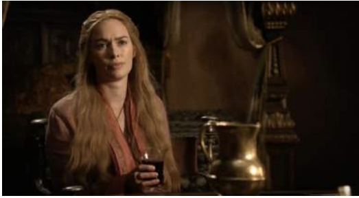
Figure A37 – Season 1, Episode 5