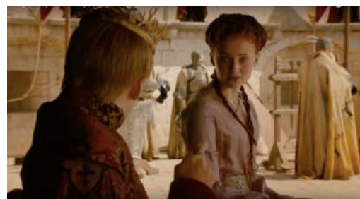
Figure 17 – Season 2, Episode 1

In season two , Sansa is kept by the Lannister's (figure 17) staying betrothed to Joffrey, who physically and mentally tortures her. Since her sister Arya managed to escape and the rest of the Stark entourage was killed, she has no allies and trusts no one, fearing each sign of hope could be a trap.