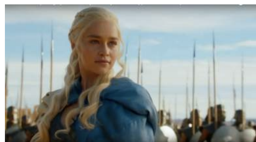
Figure A15 – Season 3, Episode 4

She leads armies (figure A15), conquers cities and tries to bring up the dragons. As Queen of Meereen she is struggling with staying put and ruling, whilst her dragons enter a pubertal rebellious phase. As a result she neglects her role as mother of dragons and becomes a fulltime ruler. When the dragons are grown they reattach and obey her.