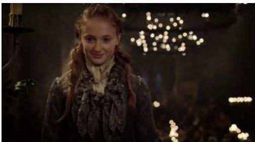
Figure 16 – Season 1, Episode 1

In Kings Landing Sansa is adapting to the life at royal court, while her father finds out about the incest of queen Cersei with her twin brother Jamie Lannister, which brought forth her three children. Before Ned can reveal the truth, King Robert dies, due to a hunting accident, and Ned is imprisoned by Cersei for treason. Sansa is forced to declare her loyalty to King Joffrey Baratheon, begs for mercy for her father and ensures he would withdraw his accusation. At Ned's public trial, he does what Sansa predicted, but new king, Joffrey, beheads him anyhow.