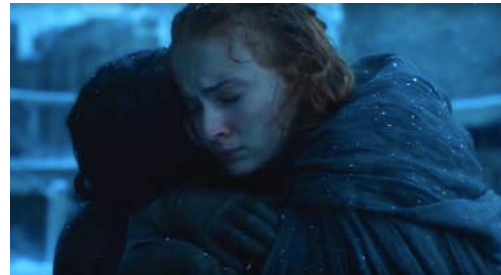
Figure 21 – Season 6, Episode 4

She reaches Castle Black in season six , where her half brother Jon is located. After years of separation they are reunited (figure 21) and Sansa can convince Jon to help her taking back Winterfell.