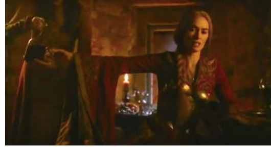
Figure A38 – Season 2, Episode 9