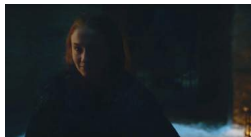
Figure 23 – Season 6, Episode 10