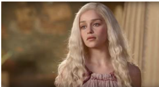
Figure A1 – Season 1, Episode 1

Daenerys values her friends and advisors counsel and decides to not act on her emotion, but to wield better measures for a better world. Daenerys does not reveal her true emotions to many people and lost the persons she trusted and communicated her fears to, when Ser Barristan dies. This role can be filled by Tyrion (figure A2), who proves himself as a smart and loyal companion and reminds her about what differentiates her from her father. With him at her side it looks like she has got the strength to be the honorable and just leader she is aiming to be.