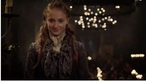
Figure A24 – Season 1, Episode 1