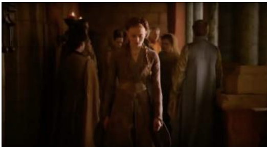
Figure 18 – Season 2, Episode 10

Stannis Baratheon, the late king’s brother, attacks the castle as he considers himself the rightful heir. Sansa hopes to be rescued by him, yet Stannis is defeated through the union of house Lannister and House Tyrell (see Appendix XI). The engagement between Sansa and Joffrey is terminated and she gets replaced with Lady Margaery Tyrell, to reestablish the bond with the Tyrells. After hearing the news, she walks out of the room downhearted (figure 18), yet as soon as no one can see her she starts smiling (figure 19). She developed the tactic to appear broken in front of her punishers, even in the short moments when she is not, to protect herself.