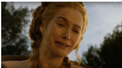
Figure 27 – Season 4, Episode 2

At Joffrey's wedding day in season four , he gets poisoned and dies in Cersei's arms. Her sadness and grief (figure 27) is closely followed by anger, hatred and the long for revenge (figure 28).