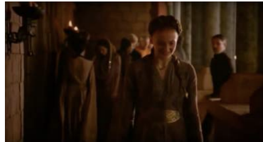
Figure 19 – Season 2, Episode 10

In season three , Sansa is befriending Lady Margaery, who intends to marry Joffrey despite of the knowledge of his evil nature. The women plan a wedding between her and Margaery’s brother Loras, which would enable Sansa to leave Kings Landing. New Hand of the King Tywin Lannister yet discomfit them, arranging a wedding between her and his son, the dwarf, Tyrion Lannister. Soon after, she learns about the death of her mother and brother, Robb, and the Stark’s loss of Winterfell, causing a depression in her.