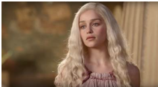
Figure 5 – Season 1, Episode 1

Daenerys, one of the last heirs of house Targaryen, a former great house with a long history of dragon riders, grows up with her older brother Viserys in Essos (see Appendix VI). Both had to flee Westeros from King Robert Baratheon, who overthrow their father. They never get to know what home is and travel around, looking luckless for supporters, in order to raise an army and claim back the Throne. Illyrio Mopatis, a supporter of their house, harbors the submissive and sensitive girl (figure 5) and her violent brother.