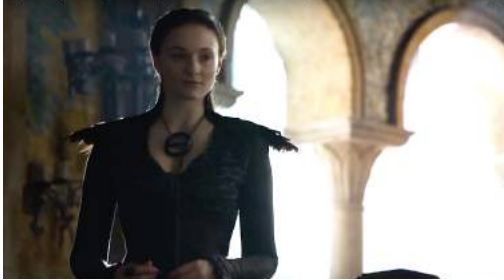
Figure A26 – Season 4, Episode 8