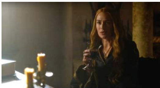
Figure 29 – Season 4, Episode 5

In season six , Jaime returns from his failed mission, with the corpse of their daughter Myrcella. Cersei remains at the Red Keep, where most people avoid her, including her own son. She is supposed to attend a trial about her sins together with Lady Margaery and Ser Loras. Instead of doing so she blows up the Great Sept, where the trial takes place, which kills all her enemies, as well as many innocent common and noble people. Subsequently, Tommen commits suicide and ultimately Cersei names herself Queen (figure 30).