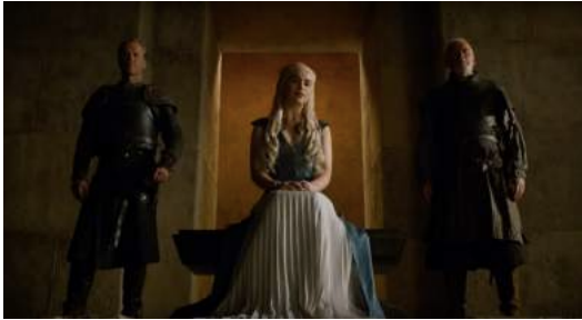
Figure A7 – Season 4, Episode 6