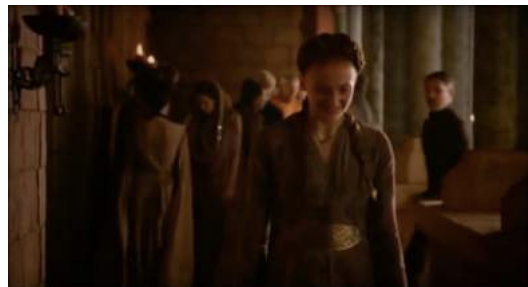
Figure A19 – Season 2, Episode 10

The friendship between Sansa and Margaery built in season three means a lot to Sansa and makes her feel like a human being again. The prospect of becoming Lora's wife and leaving Kings Landing is a ray of hope for her, not realizing that Margaery's friendship and efforts are most of all a tactic to connect the powerful North with her own house. Her actual wedding with Tyrion is another humiliation for her, but not as bad as she expected.