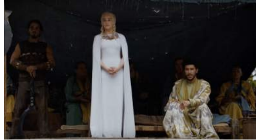
Figure A8 – Season 5, Episode 7

With pale skin and silver hair Daenerys clearly sets herself apart from typical inhabitants of Essos, who mainly appear with toned skin and dark hair. She is aware of the fact, that she is different. Being different is what attracts people, opens doors to her and helps her to achieve her goals. She yet also appears like a white savior freeing and then ruling over people with toned skin. Her physical ability of being able to stand fire and gaining back the control about her dragons, at the end of season six, vests her with more power than other throne claimants.