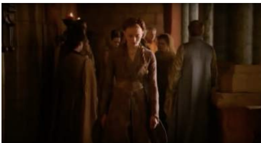
Figure A18 – Season 2, Episode 10

Despite of her sadness and unhappiness, she is strong enough to keep her composure, saying only the things that are expected of a lady, even though the way she says her words is not convincing at all. When in season two her engagement is annulled, she walks out of the room, looking downhearted (figure A18), yet as soon as no one can see her she starts smiling (figure A19). It is her tactic to appear broken in front of her punishers, even in the short moments when she is not.