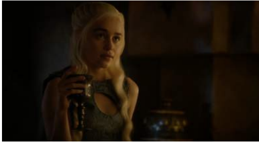
Figure 11 – Season 4, Episode 7