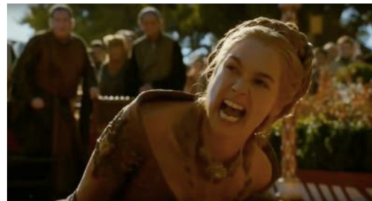
Figure A34 – Season 4, Episode 2

In seasons five and six she is turning even more sad and hateful. Her emotions seem to drive her deeper in her plotting and revenge actions, until she has turned everyone against her. Still she does not want to give up.