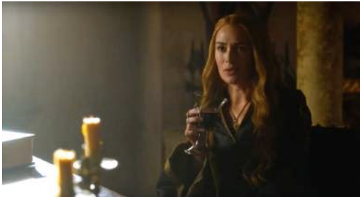
Figure A39 – Season 4, Episode 5