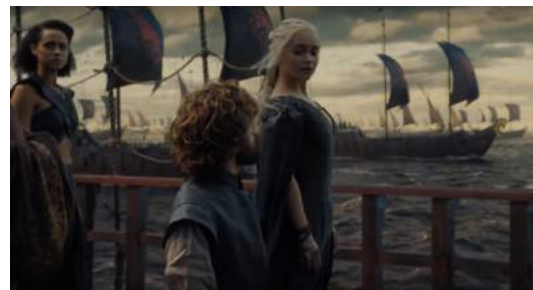
Figure A2 – Season 6, Episode 10