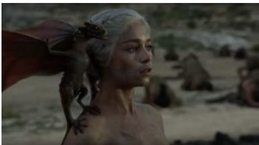
Figure A14 – Season 1, Episode 10

Living in a strange country, without many loyal supporters and having a title but no kingdom that is supposed to go with the name, Daenerys has no possibilities to obtain power by herself. As wife of the Khal she gets a queen-like status and experiences the feeling of having power for the first time. With the hatch of her dragons (figure A14) and the death of Drogo her status can be comparable with a single parent. Instead of becoming a Dosh Khlaleen, what all widows of a Khal are supposed to do, she promotes to the leader of her own khalasar.