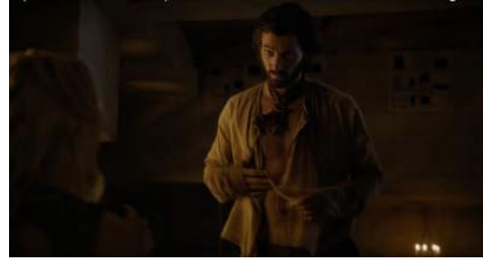
Figure 12 – Season 4, Episode 7

In season four , Meereen is conquered by Daenerys, where she decides to stay put and rule (figure 10). She starts an affair with Daario (figures 11 & 12), commander of the Second Sons, exiles Sir Jorah, when it is revealed that he was spying on her for King Robert, and locks up her dragons, who are getting dangerously out of control. Drogon yet escapes. Additionally, Riots start, since not all Meereen citizens are able to adapt to the new rules, which for example ban slavery from the town.