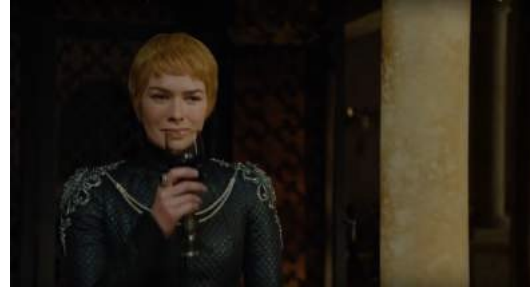
Figure A40 – Season 6, Episode 10