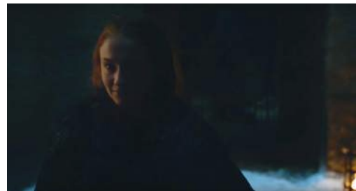
Figure A21 – Season 6, Episode 10