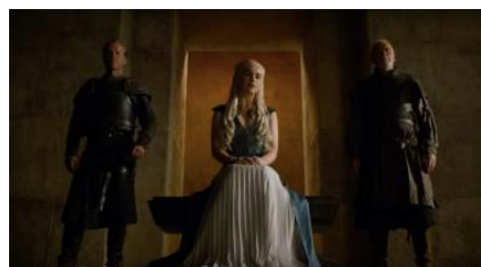
Figure 10 – Season 4, Episode 6