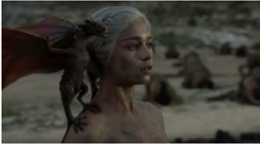
Figure 7 – Season 1, Episode 10

When Daenerys gets pregnant Viserys threatens her unborn baby, as an attempt to be forcing Drogo to pay his debts, yet he kills him. Eventually, also Drogo dies from an infected wound, contracted during a fight with a member of his khalasar, who insulted his wife. Shortly before his death Daenerys conceives her son stillborn. At their funeral, she places the three dragon eggs on the pyre, steps into the flames and rises from the ashes with hatched dragons (figure 7).