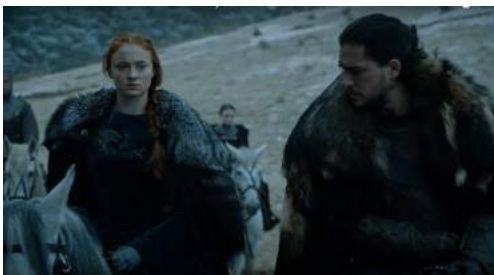
Figure 22 – Season 6, Episode 9

Together they travel through the North, trying to reconnect with other northern houses to raise an army against the Boltons. Their numbers are alarmingly small, so that Sansa calls upon Lord Baelish and his knights of the Vale, despite of her personal grudge towards him, for selling her off to the Boltons. Sansa is not fighting, but present at all events from preparation until the actual fight (figure 22). Her supporting soldiers arrive just in time and they can claim back the North in an epic fight. Sansa is getting her revenge on Ramsay and feeds him ruthless to his hounds (figure 23). Even though Jon is known to be a bastard and Sansa a true Stark, the northern people chose him to be the new King in the North.