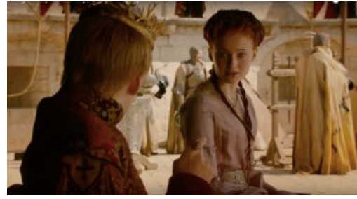
Figure A25 – Season 2, Episode 1