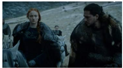
Figure A27 – Season 6, Episode 9

In company of Petyr Baelish, she starts sewing her own cloth again, appearing as a matured, dark, femme fatal (figure A26). Changing her look, is part of her cover as Lord Baelish`s niece, but by adapting a more mysterious and dark look, she appears more confident and serious, which demonstrates that she is not the naïve girl in pink costumes anymore. Until being back at Winterfell and imprisoned by husband Ramsay, she therefore physically looks like a mature empowered woman. Ramsay abuses her badly, but when being freed, she is living up again, looking strong and embracing her northern heritage. She sews cloth for Jon and herself, to proudly represent the power of house Stark, when presenting themselves before going into battle, in season six (figure A27).