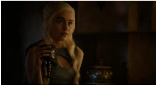
Figure A10 – Season 4, Episode 7

gives him hope of having a relationship with her. Towards the end of season four she clearly expresses her sexual desires, demanding Daario to take off his cloth (figures A10 & A11).