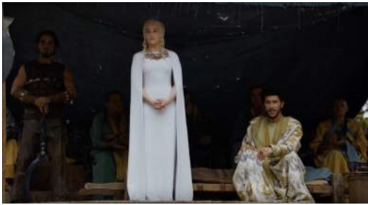
Figure 13 – Season 5, Episode 7

direction, Daenerys lands in the Dothraki Sea, where the Dothraki imprison her, whilst Drogon is still recovering from the attack in the fighting pit. In season six , Daenerys is brought to Khal Moro. After realizing that she is the widow of Khal Drogo, he decides to give her a trial whose outcome would either result in her execution or in allowing her to live with the other widowed khaleesi in the Temple of the Dosch Khaleen. Daario and Jorah, team up and set out to find her, what they do. At her trial Daenerys sets the building on fire, which was prior locked by Daario and Jorah. When the door bursts in the flames, fireproof Daenerys steps out, making the whole tribe bow in front of her and accept her as leader of all Dothraki. When they return to Meereen, Daenerys finds the city at war with the Slave Masters, who do not accept her decision to banish slavery. She works out a plan with Tyrion, calls for her Dragons and slaughters their ships. Afterwards she names Tyrion Hand of the King and they finally set sail to claim the Iron Throne in Westeros (figure 14).