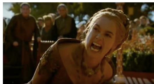
Figure 28 – Season 4, Episode 2