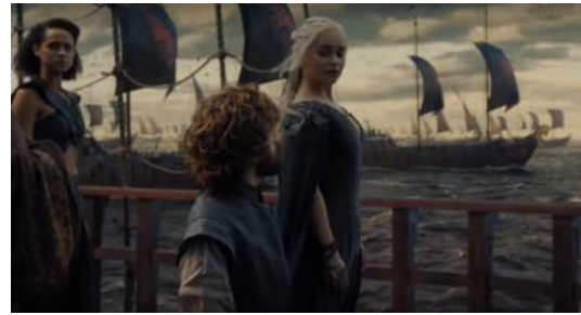
Figure 14 – Season 6, Episode 10