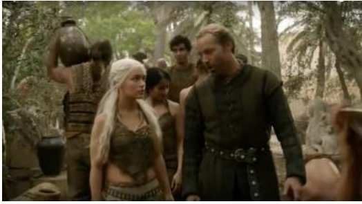
Figure A5 – Season 1, Episode 7