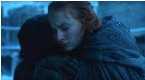
Figure A20 – Season 6, Episode 4

She convinces Jon to fight on her side but withholds him the letter to Lord Baelish asking for support. He is her brother, but she does not completely trust him nor confide in Lord Baelish's appearance. Before the battle she faces her biggest living punisher, Ramsay, and confidently promises him his death the next day. At the end of season six the sensitive, kind Sansa is gone. It is a powerful moment when she smiles while walking off the kennels, where Ramsay is locked with his starving hounds, who kill him (figure A21).