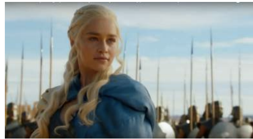
Figure 8 – Season 3, Episode 4

In season two , she starts a journey with the remnant of her khalasar, the dragons Drogon, Viserion, and Rhaegal and Ser Jorah. They arrive exhausted and parched at a city called Quarth, which rescuing access through the city gates she first has to discuss about with their ruling council. After being welcomed, she receives a marriage proposal by a member of the ruling council. He wants to take advantage of her miserable position, yet she refuses him. Half of her khalasar is murdered and her dragons are stolen. She manages to locate them and kill her enemies with the dragons, who are still small but trained on her command. In season three , her journey continues and her dragons grow when she arrives in Astapor, one of the three great cities in Slaver's Bay, where she is aiming to obtain an army. She negotiates to exchange her biggest dragon for the entire army of unsullied, skilled and disciplined slave-soldiers, owned by Kraznys mo Nakloz. She lets Drogon kill him and frees all soldiers, who afterwards accompany her by choice (figure 8). Additionally, Ser Barristan Selmy (see Appendix VIII), previous member of her father's Kingsguard, arrives in Essos and joins her cause. Daenerys and her councilors (figure 9) use her troop to free the slaves of Yunkai, joined by the Second Sons (see Appendix IX).