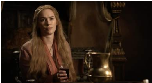
Figure 25 – Season 1, Episode 5

In season one the royal family travels from Kings Landing to Winterfell, where King Robert visits house Stark, naming his old friend Ned Stark, Hand of the King, due to the death of the previous hand. He also arranges the engagement between Joffrey and Sansa, daughter of the Starks. Cersei has an incest relationship with her twin brother and is caught, having sex in a derelict tower, by the ten-year-old Bran, son of the Starks. Jaime pushes him out the window to protect their secret. The boy survives, but cannot remember what happened.