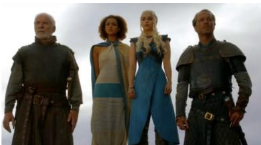
Figure 9 – Season 3, Episode 10

In season two , she starts a journey with the remnant of her khalasar, the dragons Drogon, Viserion, and Rhaegal and Ser Jorah. They arrive exhausted and parched at a city called Quarth, which rescuing access through the city gates she first has to discuss about with their ruling council. After being welcomed, she receives a marriage proposal by a member of the ruling council. He wants to take advantage of her miserable position, yet she refuses him. Half of her khalasar is murdered and her dragons are stolen. She manages to locate them and kill her enemies with the dragons, who are still small but trained on her command. In season three , her journey continues and her dragons grow when she arrives in Astapor, one of the three great cities in Slaver's Bay, where she is aiming to obtain an army. She negotiates to exchange her biggest dragon for the entire army of unsullied, skilled and disciplined slave-soldiers, owned by Kraznys mo Nakloz. She lets Drogon kill him and frees all soldiers, who afterwards accompany her by choice (figure 8). Additionally, Ser Barristan Selmy (see Appendix VIII), previous member of her father's Kingsguard, arrives in Essos and joins her cause. Daenerys and her councilors (figure 9) use her troop to free the slaves of Yunkai, joined by the Second Sons (see Appendix IX).