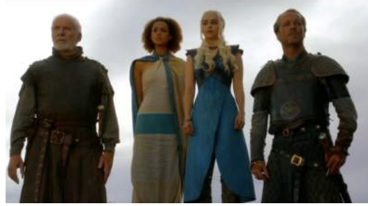
Figure A6 – Season 3, Episode 10