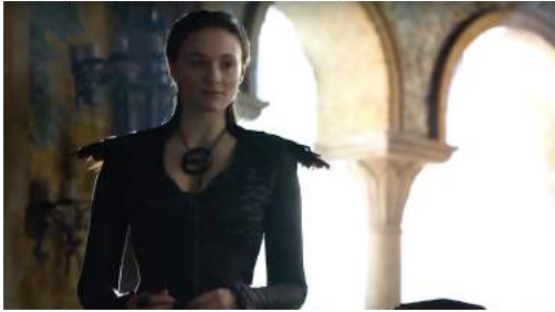
Figure 20 – Season 4, Episode 8

disguise (figure 20). In season five , they arrive in the North, where Sansa agrees to Lord Baelish plan, marrying Ramsay Bolton, new Lord of Winterfell, in order to avenge her family. Baelish leaves her with the foresight of Stannis, attacking the North and declaring her Wardeness, yet he is defeated again. Additionally, she underestimates sadistic Ramsay and gets taken as his imprisoned wife. After failed escape attempts, the likewise imprisoned and tortured Theon Greyjoy (see Appendix XIII) helps her flee.