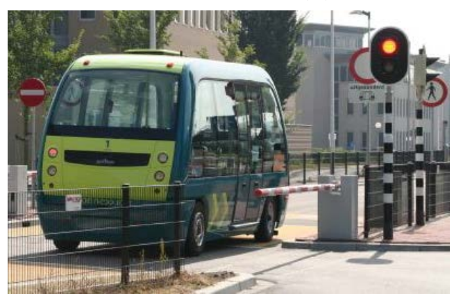
Figure 2: The Rivium ParkShuttle in operation (11)

The ParkShuttle operates on a designated lane. The designated lane is two-lane, except the overpass over the Abraham van Rijckevorselweg and the tunnel near the metro station. The lane was initially designed as a bicycle lane, hence the one-way viaduct and tunnel. Crossing traffic is managed with barriers (see figure 1). Because the vehicle is operating on a designated lane, there is minimal disturbance of other traffic (10).