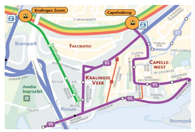
Figure 3: Public transport at Rivium (the ParkShuttle is the green line) (12)

The Frog system is integrated in the infrastructure which means the asphalt contains artificial landmarks (magnets) to help the vehicles navigate. There is a magnet every four meter. The route is 1800 meters and contains five stops. See figure 2 for the route of the vehicles.