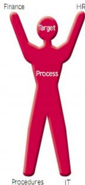
Figure 3. Connecting body and mind