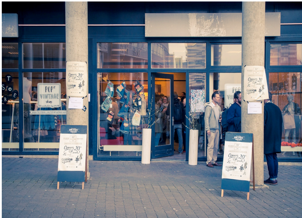
The Vintage pop-up on the day of the opening

The university teaches over 25,000 students in Bachelor, Master and postgraduate degree programmes at four campuses. At the main campus, a shopping arcade with book shops and convenience stores is part of the building. Due to lack of commercial exploiters, several spaces in this arcade had been unused for some time when the author suggested to open a pop-up store. A long-term student who is active in the vintage market and several first-year Small Business students were ready to commit themselves to the project. In order to create incomplete immersion and ambiguity, we also got in contact with a resident artist who was looking for a space for an installation called In my life . This installation consists of a clothing rack with neatly hung dresses. On touch, the hangers of the dresses activate an audio telling the visitor the memories the artist holds with each particular piece of clothing. Afterwards, the visitor can record his/her own memories of clothing in front of a static camera.