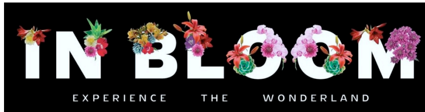
Film impression of In Bloom pop-up https://youtu.be/JY2B9e0StRQ

Furthermore, there was no advertising involved, just the promise to share information and pictures. The briefings we gave to the producing students stated minimal rules and opened up a lot of freedom to design and communicate the pop-up store as they wanted. From design, we only asked that the pop-up should allow at least 20 visitors at a time. We stressed however, that it should be immersive, experiential and interactive. From the Communication students, we requested the creation of suspense preceding the pop-up store and the conception and communication of a story around the pop-up store executed in online and offline communication. The pop-up was scheduled to be open for five days, from 4 – 8 April 2016. For research purposes, students collected data with a short questionnaire at the entrance and again at the exit of the pop-up store. We collected 200 valid questionnaires. The questions focused on the visitors' perception and appropriation of the space and of the product (flowers). Again, the author spent at least an hour every day at the pop-up and kept a logbook.