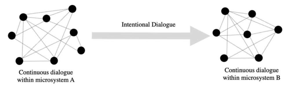
Figure 1. Intentional and Continuous Dialogues in the Context of Sustainable HRM.