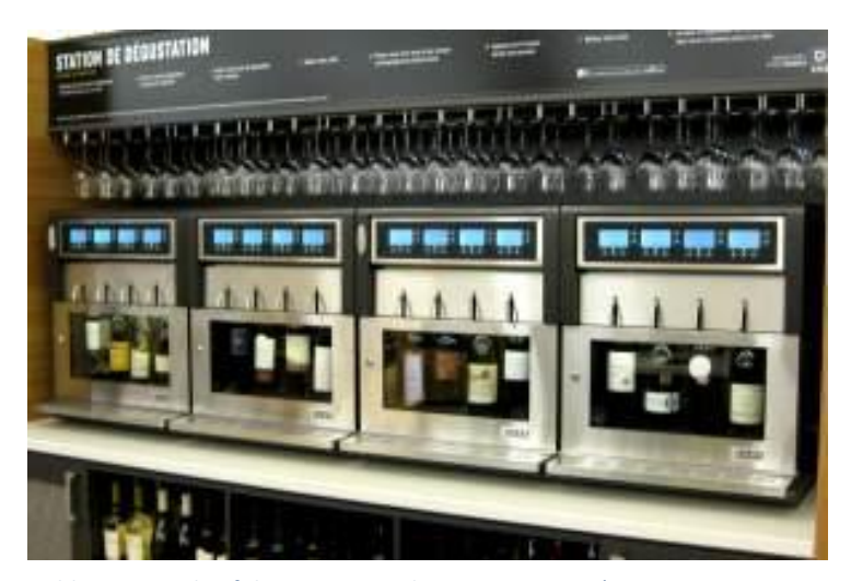
Table 3: Example of the tasting machine in SAQ store (Gagnon, Vin Québec, 2008)

The tasting machines: An example can be seen in the Table 3 . These machines are placed in some larger SAQ stores. Inside them, wines are placed to allow the customer to taste for less than 2 dollars. Thanks to this technique the customer can taste the wine and have a preview of the product before buying. This device is useful for the client because the latter will not have any bad surprise about the taste of the wine.