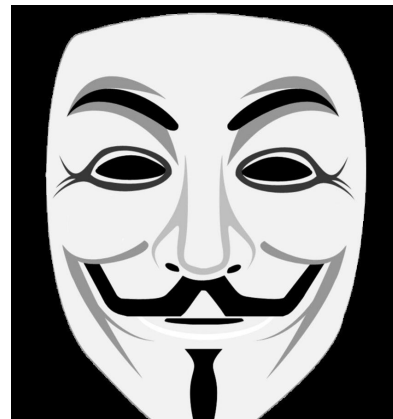
Figure 1. Guy Fawkes Mask, Retrieved on 13.04.2015 from http://imgkid.com/ anonymous-mask-drawing.sh tml

What grabbed the attention of the media and the politicians the most was, besides the turnout of more than 100 000 people in Germany alone (EDRi, 2012), the Guy Fawkes mask turning into the symbol of the movement. Used by Anonymous mainly, the mask was now visible in every protest. Guy Fawkes was a 17 th century British catholic terrorist, whose biography was adopted in a 1980's comic and a movie (Economist, 2014). Even the Polish parliament's group Pakilto's Movement wore the mask to protest the signing of ACTA on 26 January 2012. This political stunt and others alike helped to support the momentum of the movement (Euractiv, 2012).